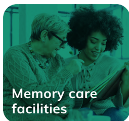
Memory care facilities