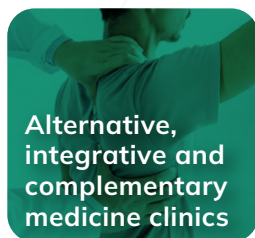
Alternative, integrative and complementary medicine clinics