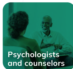
Psychologists and counselors