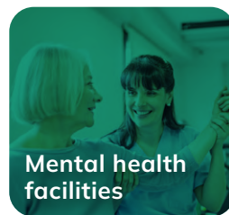
Mental health facilities